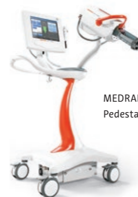
MEDRAD® Mark 7 Arterion Pedestal

Each suite is unique. With MEDRAD® Mark 7 Arterion, you can choose the configurations and mounting options for your suite and imaging system to optimize your workflow.