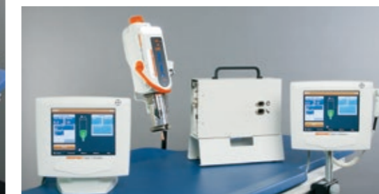
MEDRAD® Mark 7 Arterion Table Mount with Dual Monitor Option**