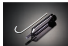
ART 700 SYR