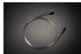
TAG C50 HPCT & TAG C150 HPCT**