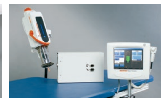
MEDRAD® Mark 7 Arterion Table Mount*