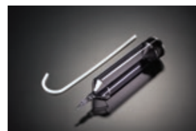
TAG 150 SYR**