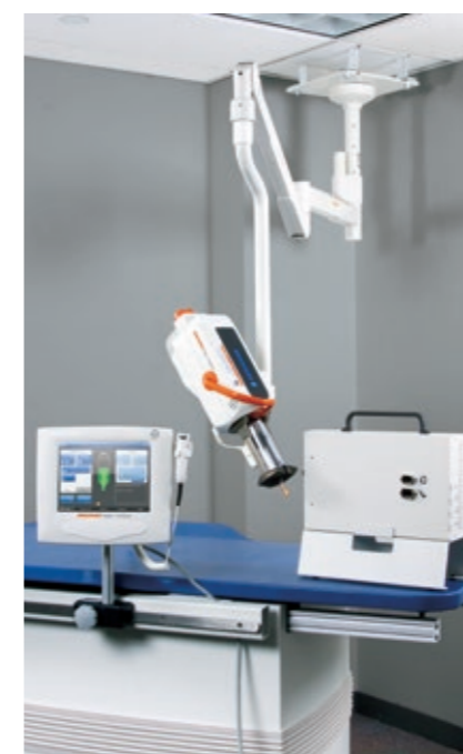
MEDRAD® Mark 7 Arterion Overhead Counterpoise*